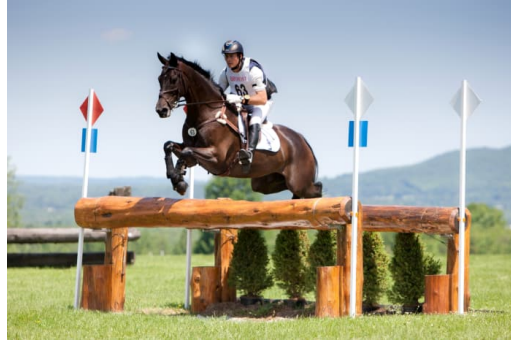
Red Bay Group